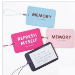
dreaming traveler name tag