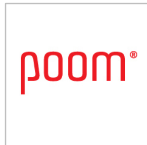
Art Box (Poom)