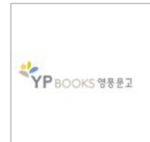
Young poong Books