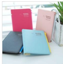
dreaming traveler passport