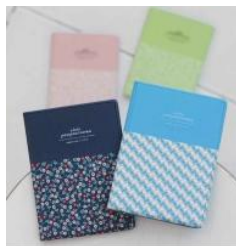
Ololo passport cover