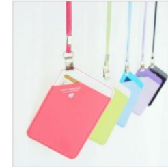
smile card case